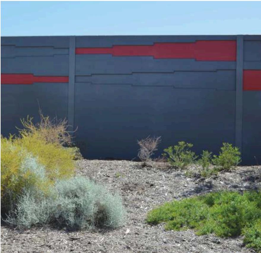
BESPOKE PATTERN WITH STEEL POSTS