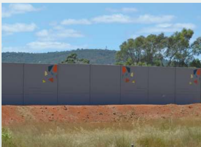
BESPOKE PATTERN WITH STEEL POSTS