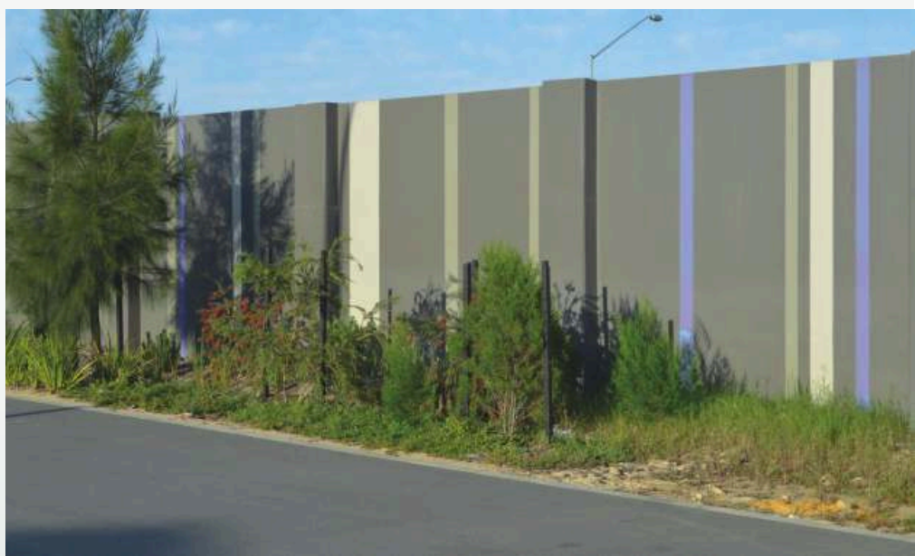
BESPOKE PAINTED PATTERN ON PLAIN PANEL AND PIERS