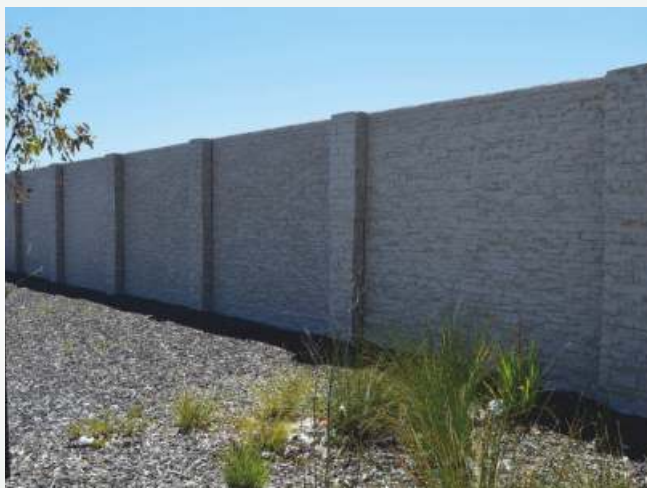
SIERRA DRY FIT